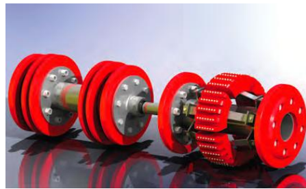
Extended sealing pigs.